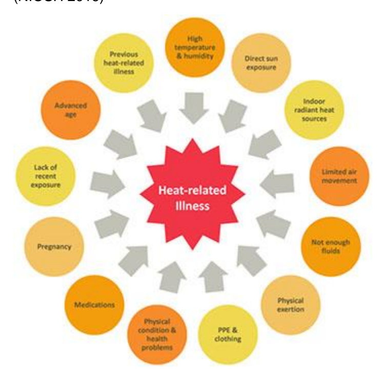
Figure 1. Heat-related illness risk factors (NIOSH 2016)

Although heat hazards are common in indoor and outdoor work environments, heat-related illness and fatalities are preventable. Many risk factors contribute to the risk for heat-related illness (see Figure 1.). A heat-related illness occurs when there is an increase in the worker's core body temperature above healthy levels. As core temperature rises, the body is less able to perform normal functions. As core temperature continues to increase, the body releases inflammatory agents associated with damage to the liver and muscles. This process may become self-sustaining and generate a run-away inflammatory response, the "systemic inflammatory response" syndrome that often leads to death.