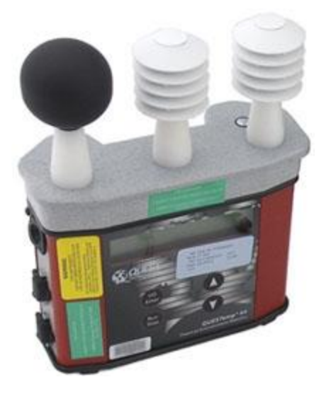
Figure 3. Quest Waterless wet-bulb meter

Although all the sensors measure temperature in Celsius and/or Fahrenheit, they represent different heat stress factors. The meter automatically calculates adjusted temperature using the sensor data inputs and programed equations. There are two different equations depending on whether the measurement is taken indoors (i.e., radiant heat unlikely or not solar) or outdoors (i.e., solar radiant heat likely). The data inputs are: