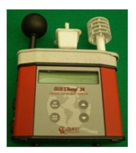
Figure 2. Quest WBGT meter with natural wet-bulb sensor

WBGT measurements are most reliable when taken at, or as close as possible to, the work area. When a worker moves between two or more areas with different environmental conditions, or when the conditions vary substantially in the work area, assess the heat hazard using representative measurements for the different conditions.